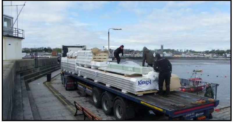
Kingspan roof being unloaded at Donaghadee Harbour

The Ocean Spray arrived at the South Jetty with the first of the roofing materials. Some members of the work party arrived with the materials while other members remained at Donaghadee to assist with the next load.