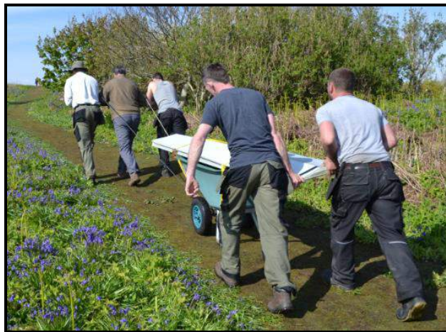
A heavy load requiring a team effort

Wheelbarrows and other improvised lifting methods were employed to move the roof materials up to the observatory buildings. This operation continued for two more boat trips. By the time the third and last boat was unloaded the water was up to the top level of the South Jetty. Another half hour or so and this jetty would have been unusable.