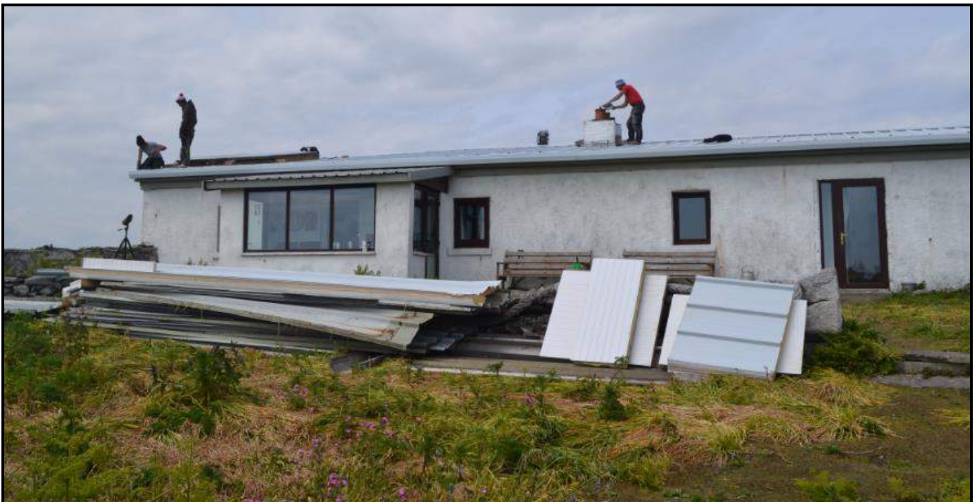
Roof nearly finished but some clearing-up work required at front of building (Monday 15 th June)