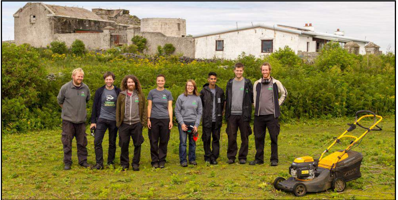
Ulster Wildlife volunteers on CBO

Ulster Wildlife volunteers visited CBO on Thursday 6 th August to take part in habitat management work. They surveyed four areas, and discussed why the various vegetation communities benefit the birds, rabbits, and visitors. They then found out why and how the current approach to managing and restoring habitats has been successful and worthwhile to ensure the habitat condition continues to improve, and access around the island is maintained.