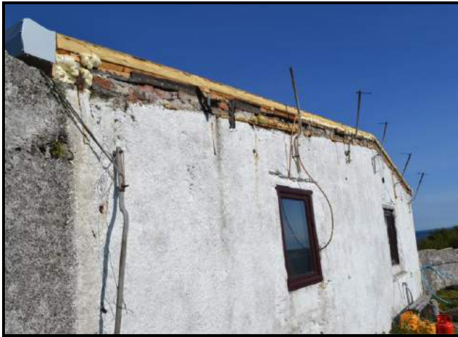
West gable with no end flashing fitted