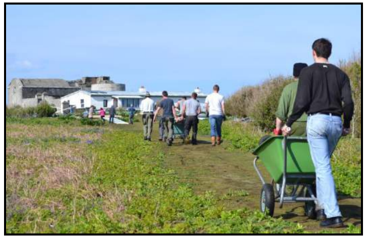
Work party transporting materials