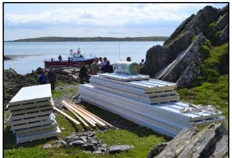
Roofing materials on the foreshore

Once docked, the roof panels and building materials were unloaded from the boat and left on the foreshore. While the boat returned to pick-up the next load, the work party on the island started to bring the heavy materials up to the observatory buildings.