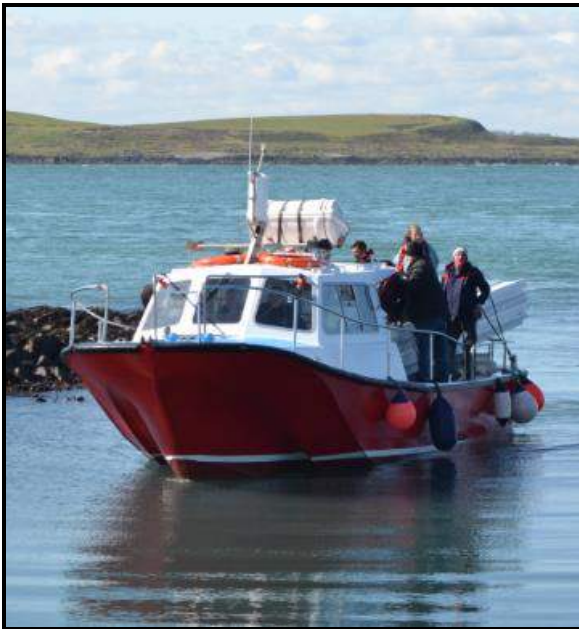
The 'Ocean Spray'

The Ocean Spray arrived at the South Jetty with the first of the roofing materials. Some members of the work party arrived with the materials while other members remained at Donaghadee to assist with the next load.