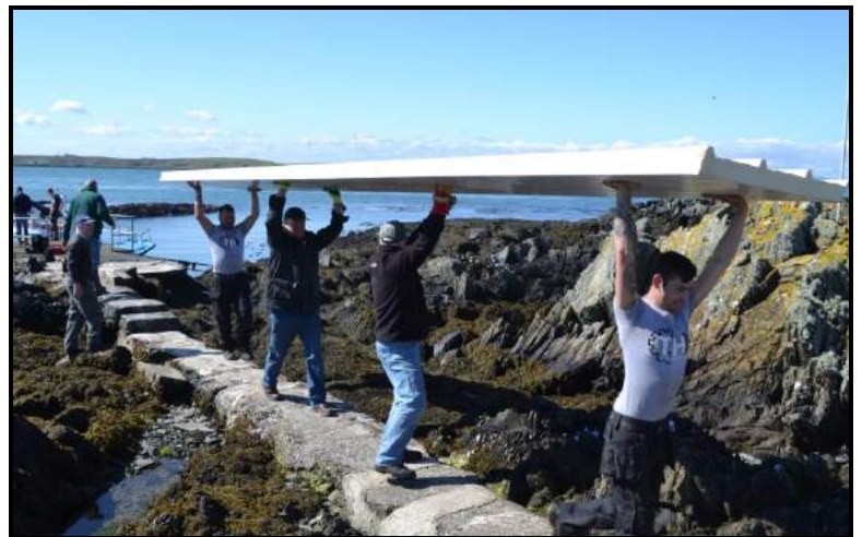
Roofing panels being unloaded at South Jetty

Once docked, the roof panels and building materials were unloaded from the boat and left on the foreshore. While the boat returned to pick-up the next load, the work party on the island started to bring the heavy materials up to the observatory buildings.