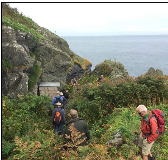
Volunteers making their way to a 'Loo with a View'

Once on the island, Ron and Niall gave the group some background information on the island, the CBO and the activities that went on there. The group was split into two and led off around the island by both Niall and Ron. The groups were able to learn about the species of birds found on the island and the important work carried out by the CBO volunteers in terms of monitoring and recording the species found there. The Volunteer Rangers were able to watch the CBO volunteers processing and ringing several Redpolls that had been caught in the mist nets that morning.