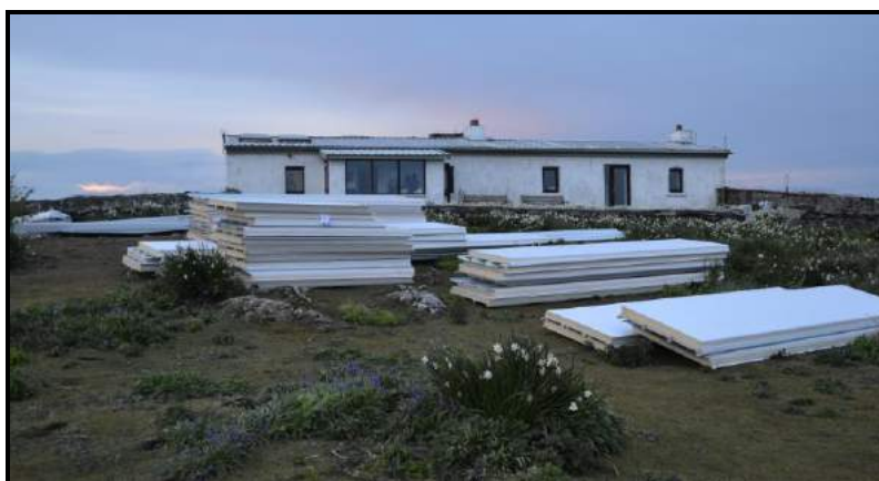
Roof panels outside the observatory on Saturday evening

By late afternoon all of the roofing materials had been transported up to the observatory buildings. This had been a very productive day. The weather had been great with the work party labouring long and hard to complete this important phase of the project.