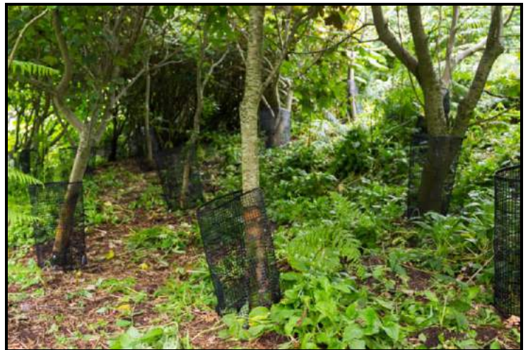
Plantation with mesh tree protectors fitted