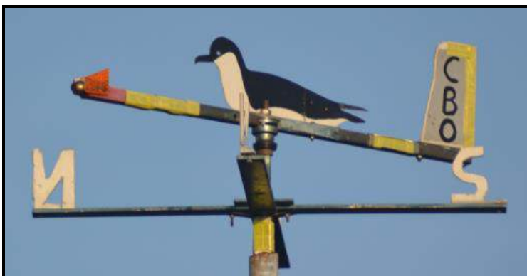
CBO weather vane