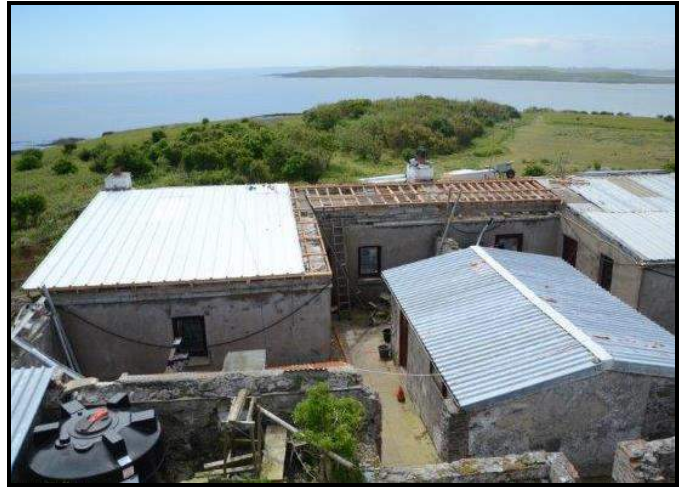
New roof partially installed on east side of building