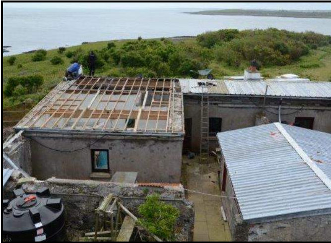
Roof stripped from east side of building

On Monday 8 th June, the work started in earnest. First, the old roof had to be removed before the new roof could be installed. Stripping the old roof off was a messy job but good weather conditions allowed steady progress to be made. The following photographs show the roofing project in various stages of development.