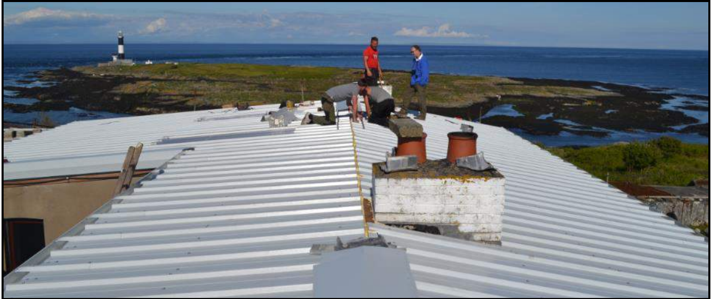
New roof starting to take shape (Sunday 14 th June)