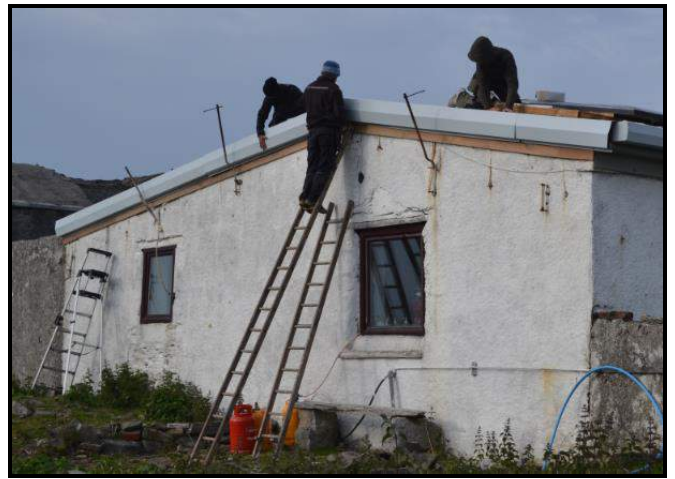
West gable with end flashing fitted