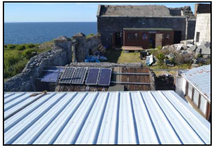
New roof over Dormitory 2