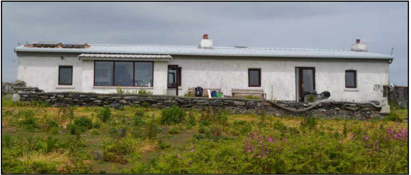
Finished roof (Tuesday 16 th June)

The installation of the new Kingspan Trapezoidal insulated roof was completed on 16 th June. This had been an ambitious project for the observatory involving several months of planning (e.g. securing funding, engaging contractors, ordering materials and organising shipping to an offshore island). Hopefully, this new roof will last for many years to come, providing visitors with a dry and secure roof over their heads.