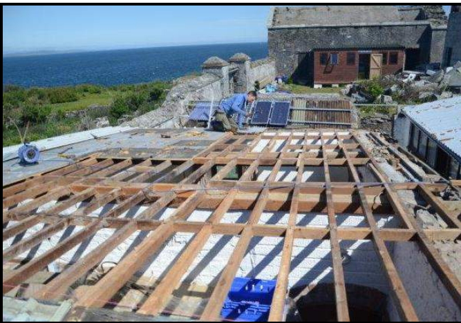
Old roof partially stripped from Dormitory 2