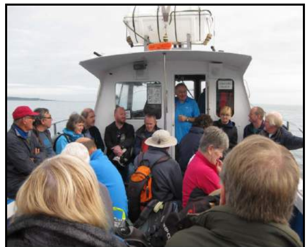
Volunteers aboard the 'Ocean Crest'

Over 100 volunteers are currently active in the programme. An annual reward scheme is organised for the Volunteer Rangers to thank them for the work that they complete for the organisation, which includes Summer and Winter Walks, and training and social events. One of this year's social events was a guided tour of Lighthouse Island, one of three islands that make up the Copeland Islands.