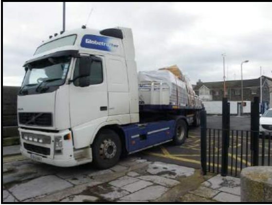
Lorry arriving at Donaghadee Harbour

On the Saturday morning, the roofing materials were brought to Donaghadee Harbour on a large lorry. A boat ( Ocean Spray ) had been chartered to transport the materials from Donaghadee Harbour to the island. Volunteers were tasked with the loading/unloading of the boat and with the transportation of materials up to the observatory buildings.