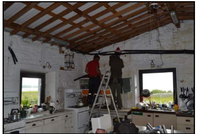
New roof on Kitchen