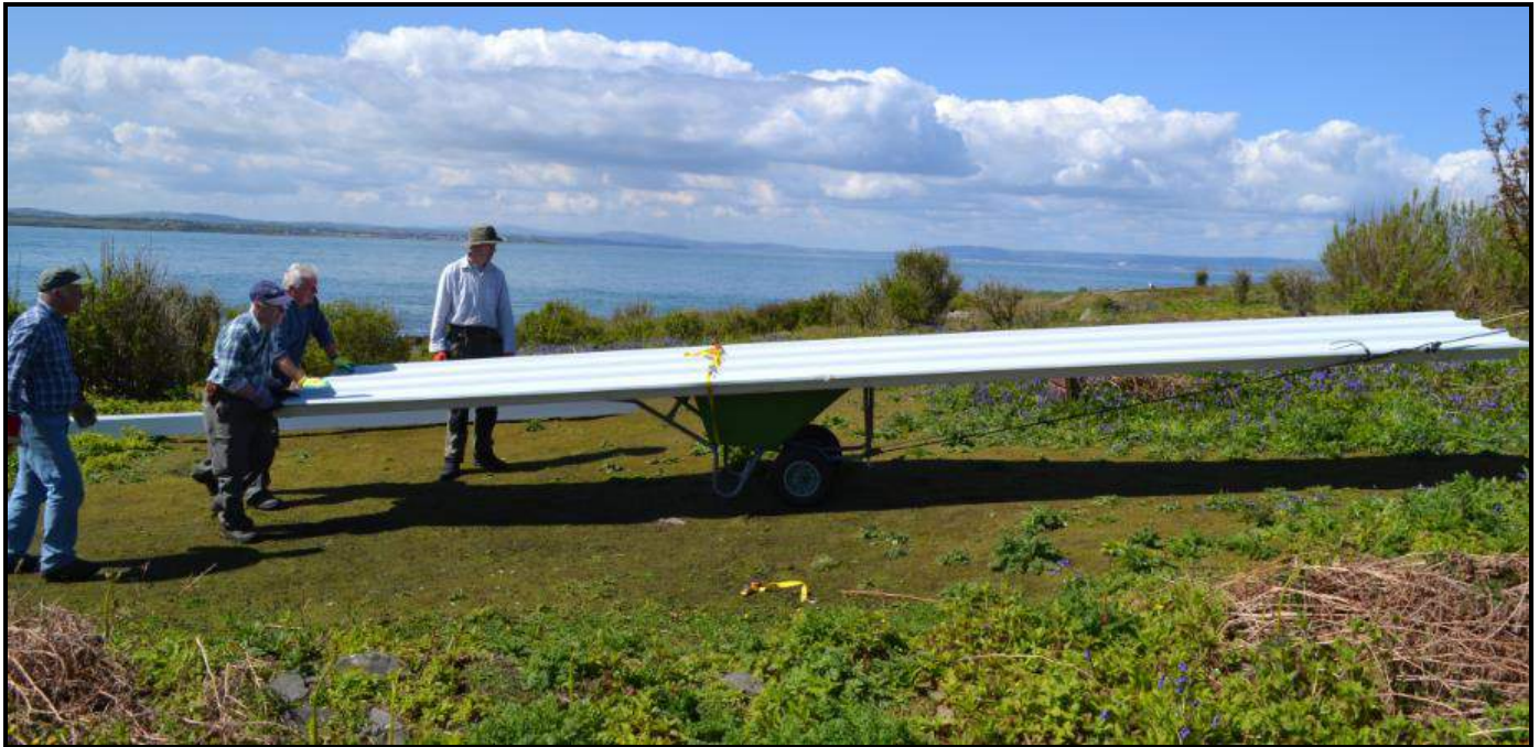
Roof panel being transported up to the observatory buildings

Wheelbarrows and other improvised lifting methods were employed to move the roof materials up to the observatory buildings. This operation continued for two more boat trips. By the time the third and last boat was unloaded the water was up to the top level of the South Jetty. Another half hour or so and this jetty would have been unusable.