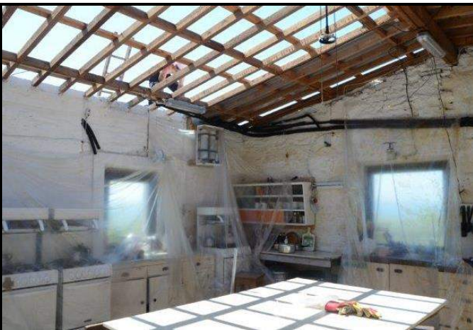
Sheets covering the Kitchen during stripping phase